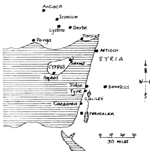
Places mentioned in Acts 9-13

Until this time the early church was made up of Jewish Christians only. The Jews hated Gentiles (non-Jews), so they did not think God could possibly want to save Gentiles. But God wants Jews and Gentiles to turn to Him. So the Jewish Christians had to be told by God that it was His will that the Gentiles should be saved. Peter was one of the most important of the apostles, and so he was chosen by God to help Cornelius.