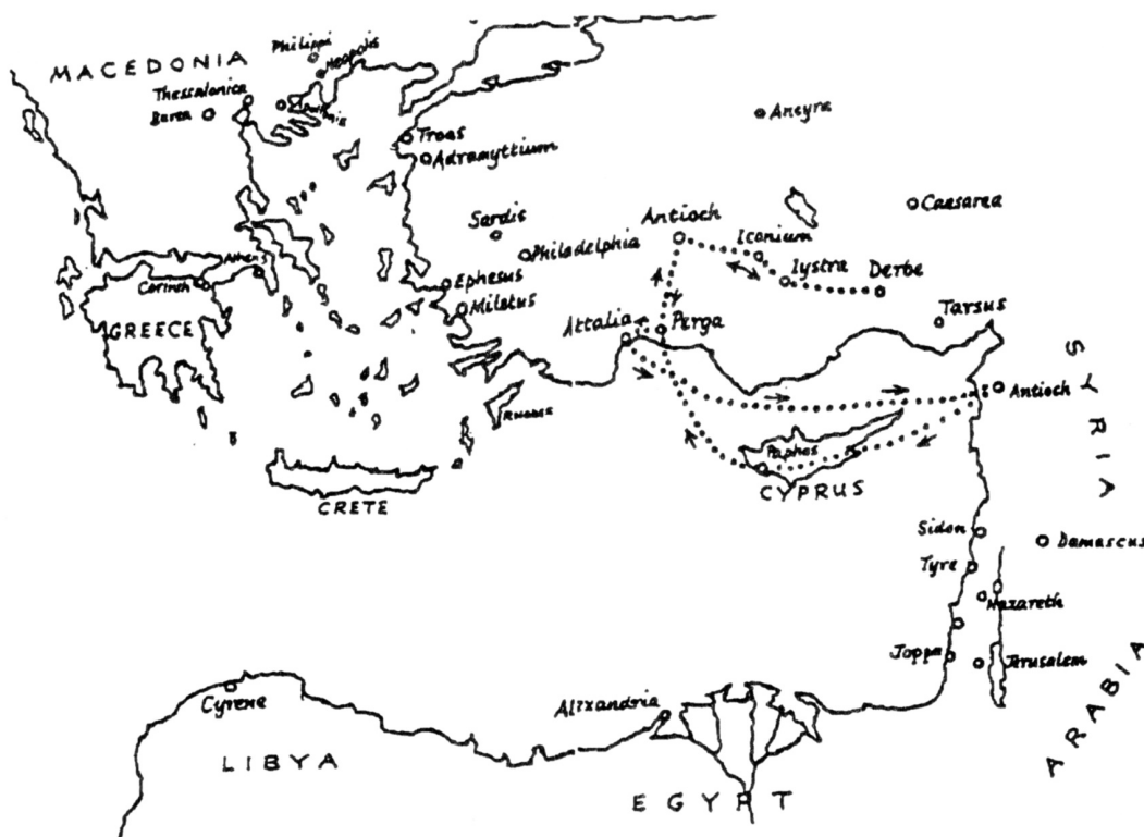
Paul's First Journey - Acts 13

Notice how Paul shows that God was in control of what happened to Israel. Verse 17 says: "..... God ..... chose our fathers" and "He brought them out of Egypt".