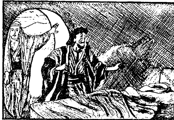
The tomb was empty!

The Book of the Acts of the Apostles continues on from the Gospels (Matthew, Mark, Luke and John). Towards the end of the Gospels we have the sad account of the torture and crucifixion of the Son of God. But the Gospels do not end there.